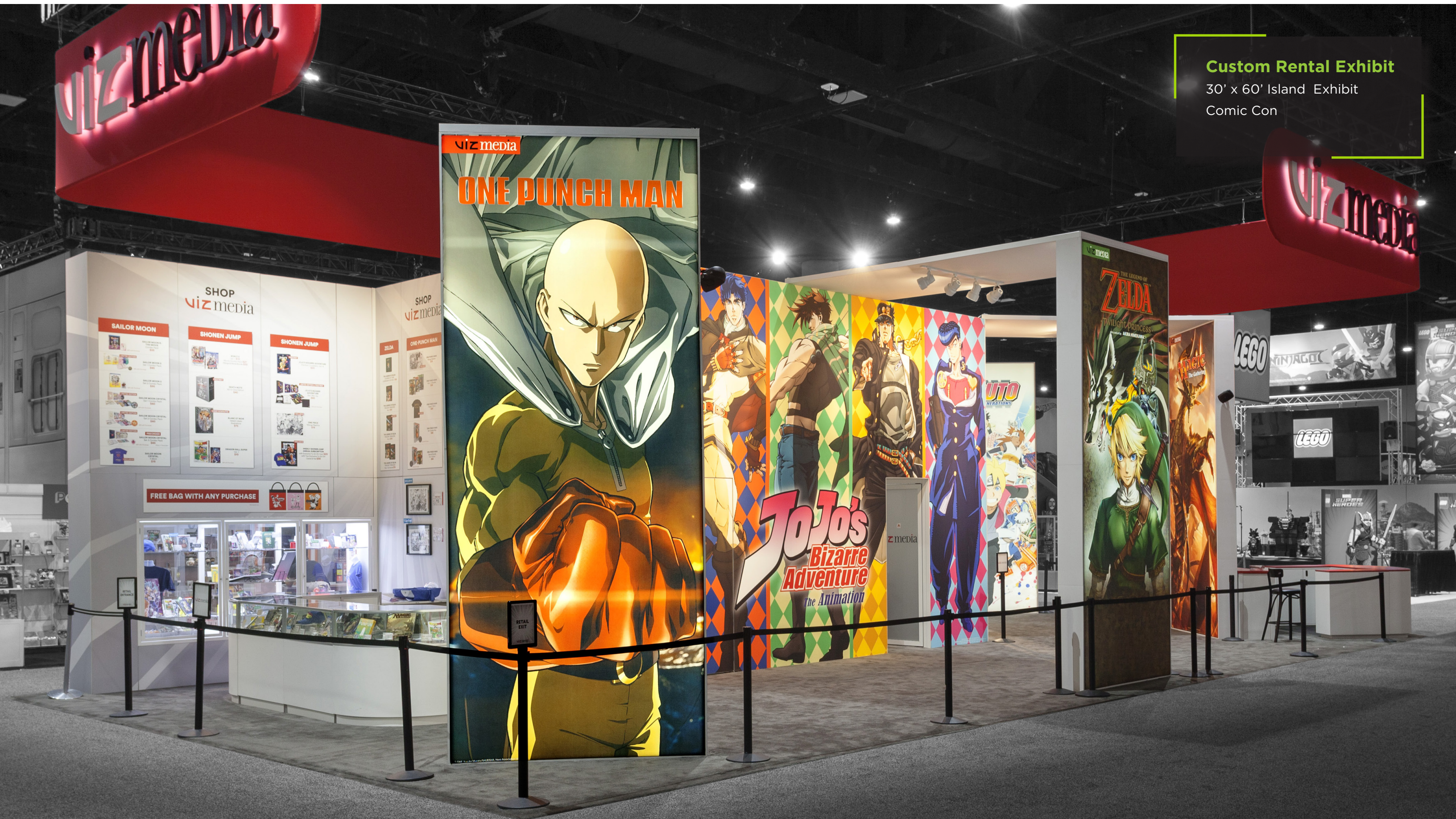
Custom Rental Exhibit 30' x 60' Island Exhibit Comic Con