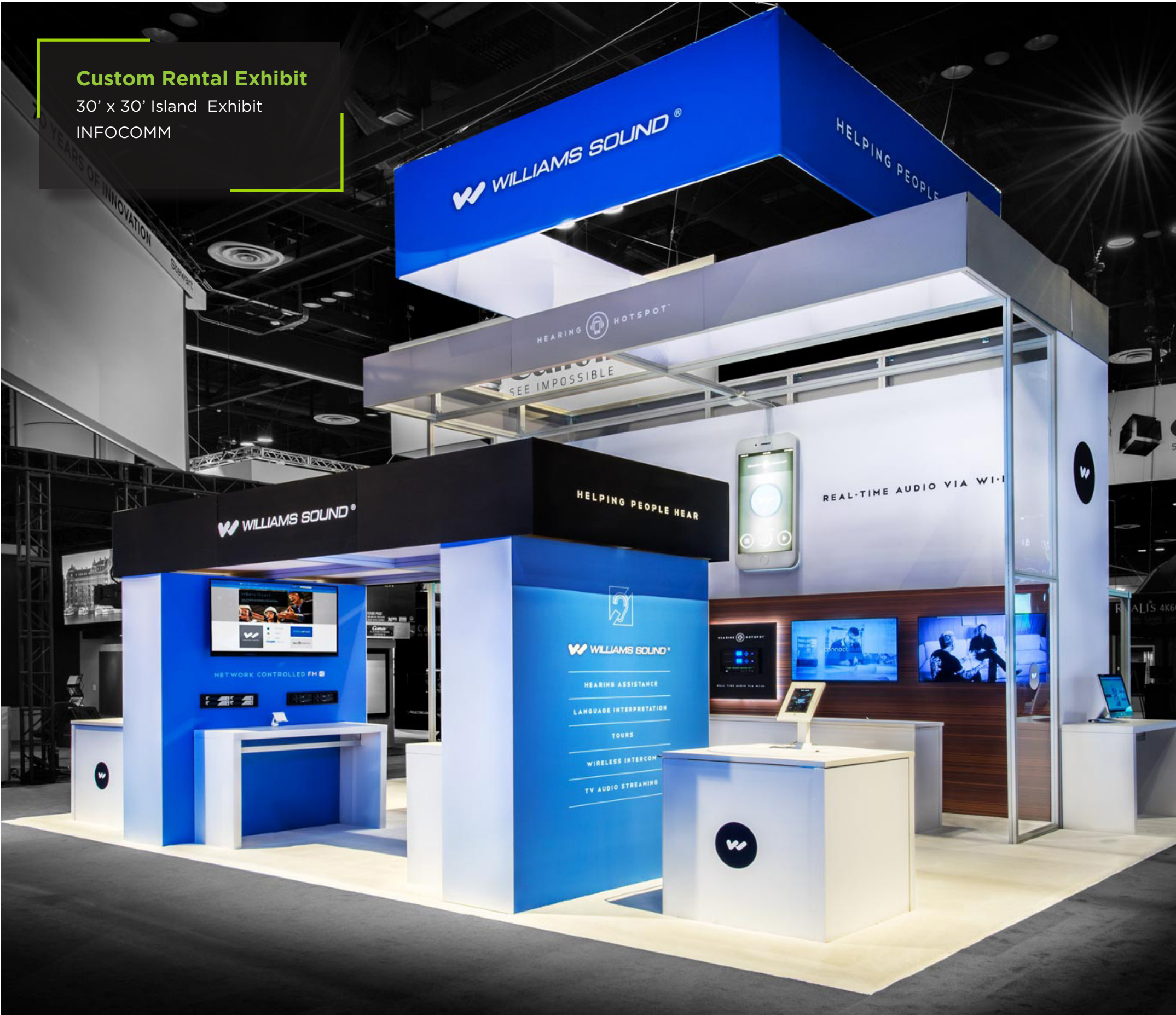
Custom Rental Exhibit 30' x 30' Island Exhibit INFOCOMM