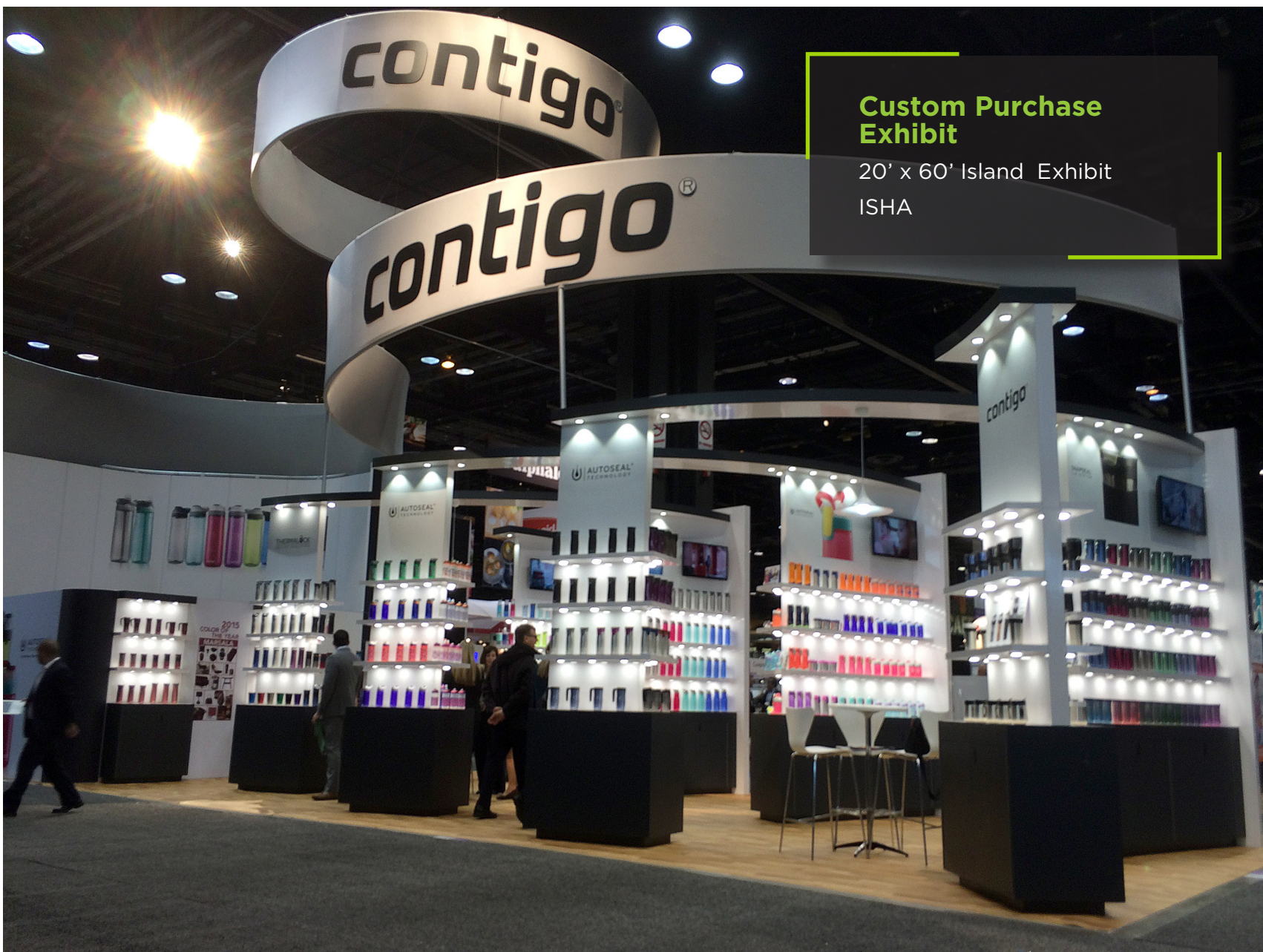
Custom Purchase Exhibit 20' x 60' Island Exhibit ISHA